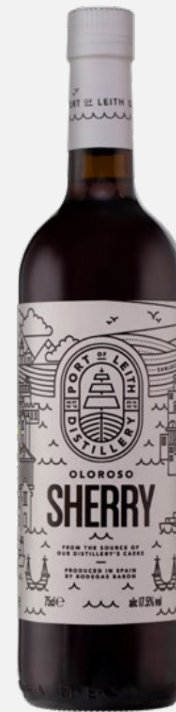
Port of Leith Distillery Oloroso Sherry 75cl