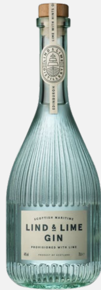
Lind & Lime Gin 70cl