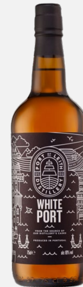
Port of Leith Distillery White Port 75cl