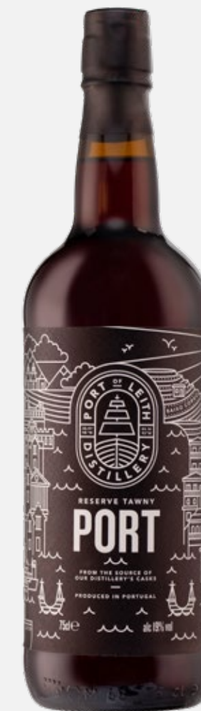
Port of Leith Distillery Tawny Port 75cl