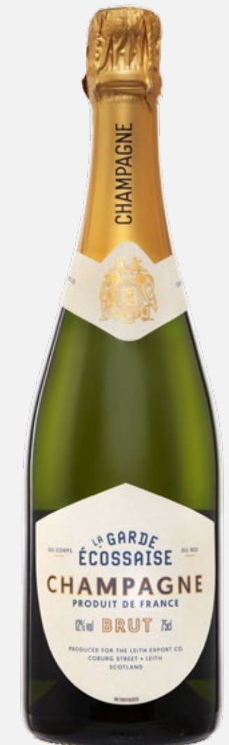
La Garde Écossaise Champagne 75cl