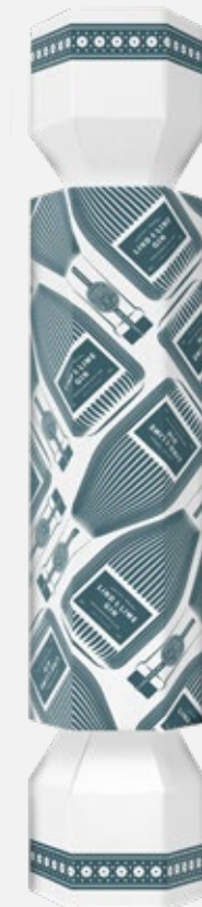
Lind & Lime Festive Cracker