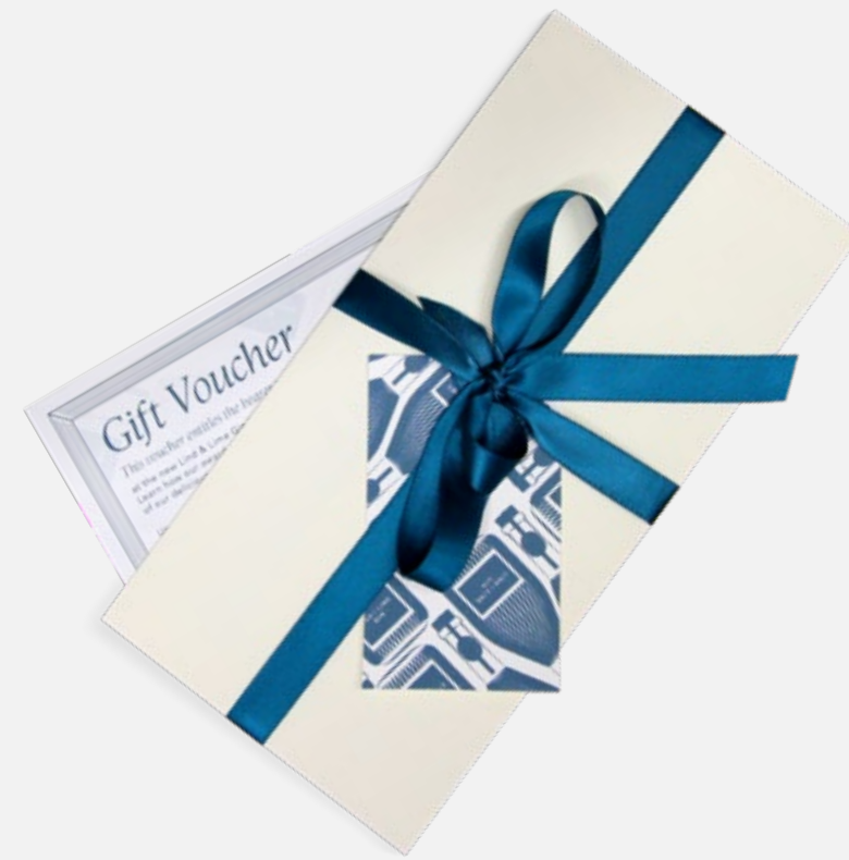
The Lind & Lime Gin Distillery Tour Voucher